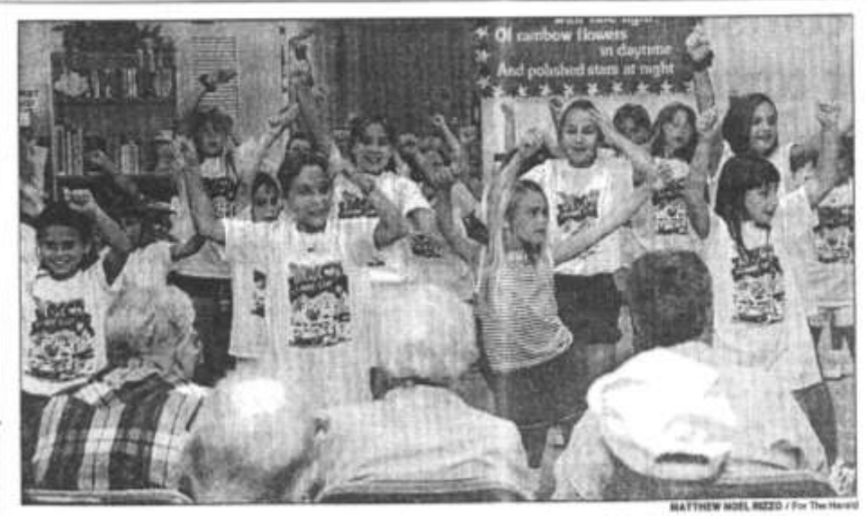
PING FOR JOY: Youngsters from America's Cheer Leaders mmer camp perform for senior citizens at the Central West